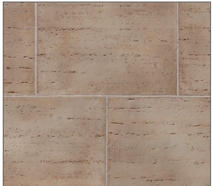
COLOSSEUM TRAVERTINE COLOR: ROMAN