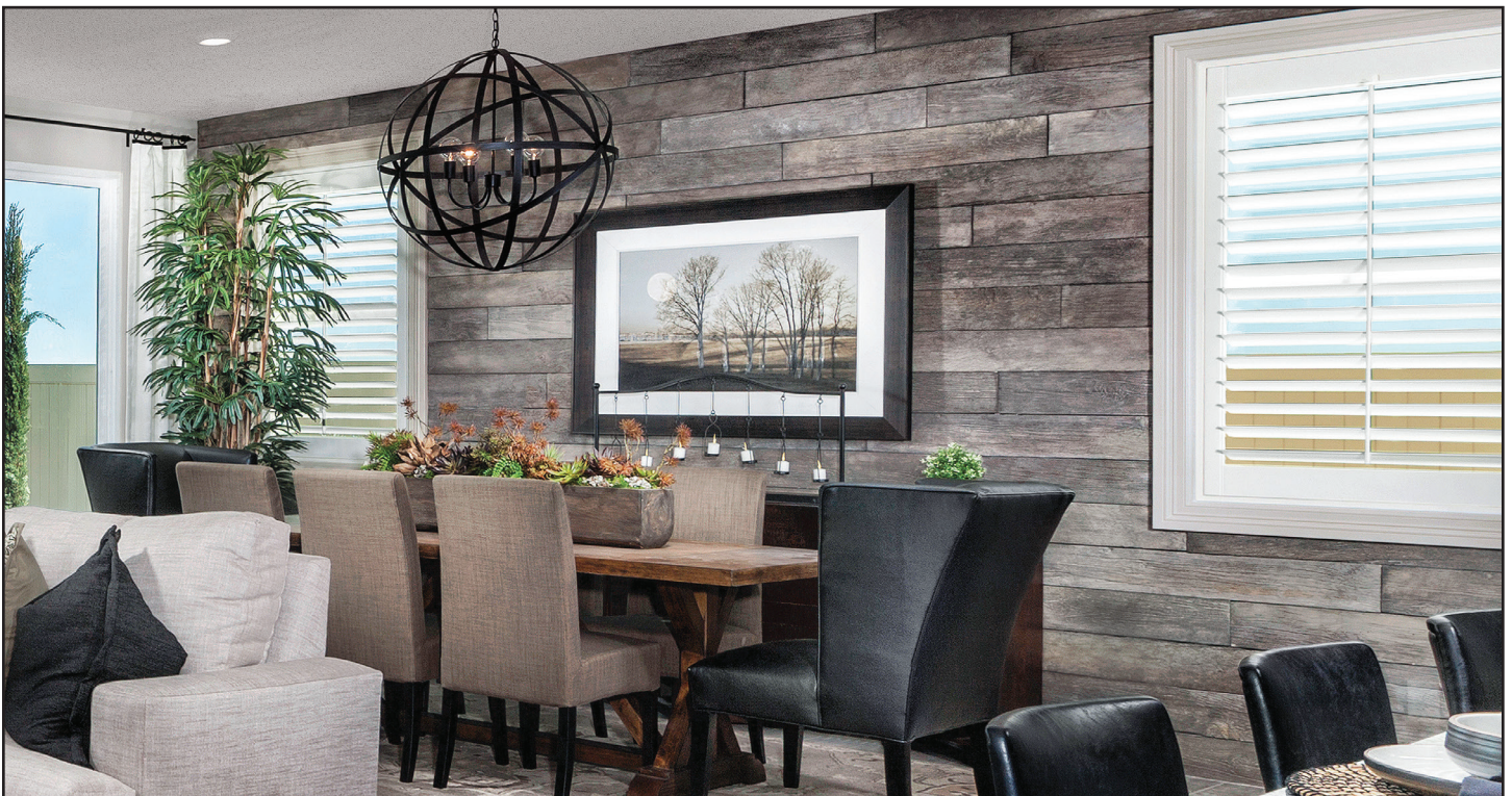
Barn WoodStone - Rustic Farmhouse

Note: WoodStone can be installed on the wall in either a horizontal or vertical pattern.