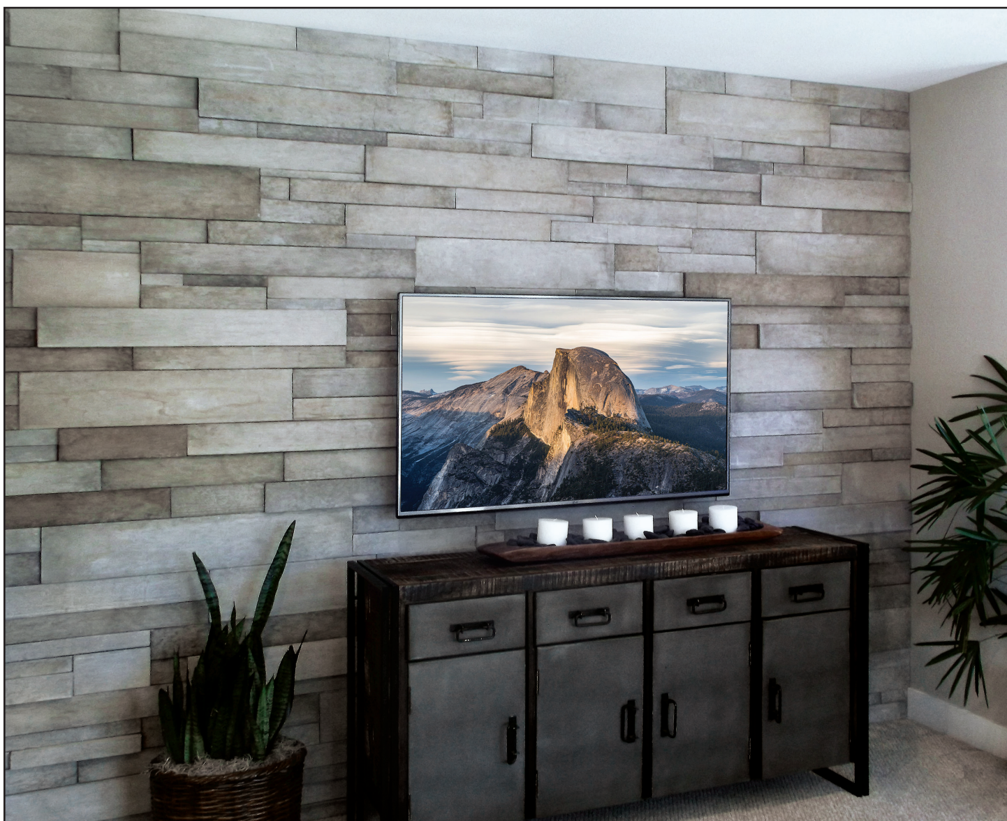
Industrial Ledge - Shale Grey

Apply the piece to the wall slightly above the desired position and work it in using a left-to-right motion until mortar squeezes from the perimeter and full-coverage adhesion is achieved. This process will also ensure enough excess mortar remains to fill any small gaps between stones and to help bond the individual pieces to each other. This will minimize the potential for moisture getting behind the stone. If too much mortar remains between the pieces, lift up the piece high enough to remove some of the excess mortar using a small tuck point trowel or similar tool and then reposition.