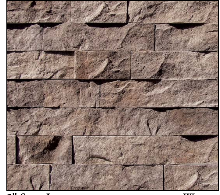
3" Split Limestone