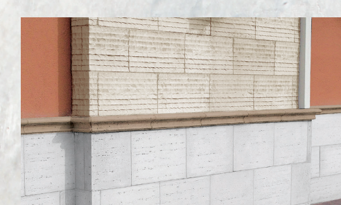
BELLA TERRA SILL - ROMAN