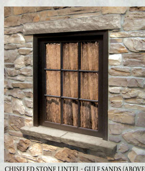
CHISELED STONE LINTEL 7 GULF SANDS (ABOVE) SPLIT STONE SILL - GULF SANDS (BELOW)