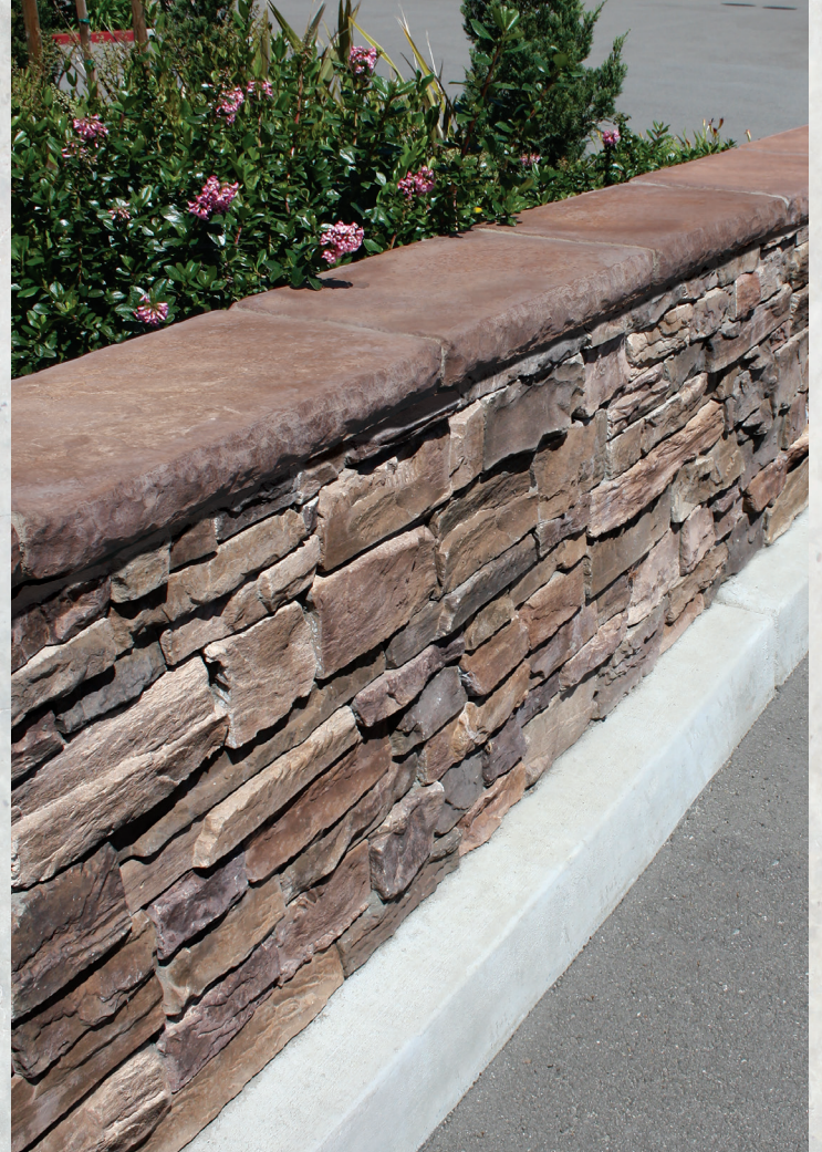
FLAGSTONE WALL CAP - BROWNSTONE