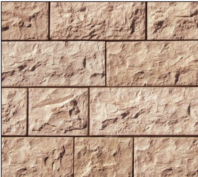
8" CLASSIC JERUSALEM