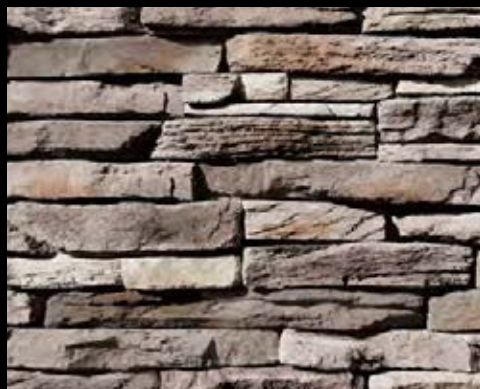
PROVO CANYON GREY