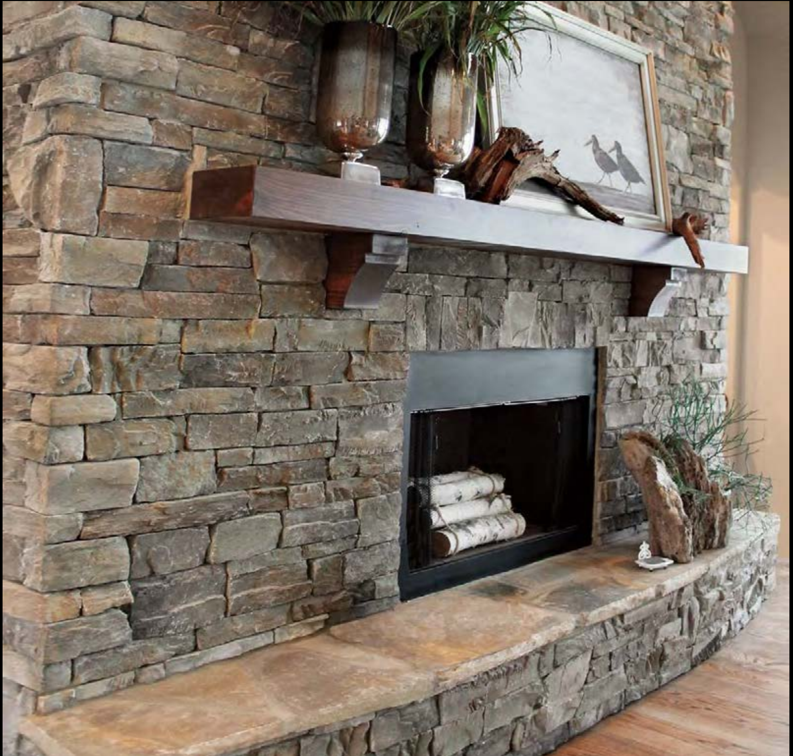
OLD WORLD LEDGE