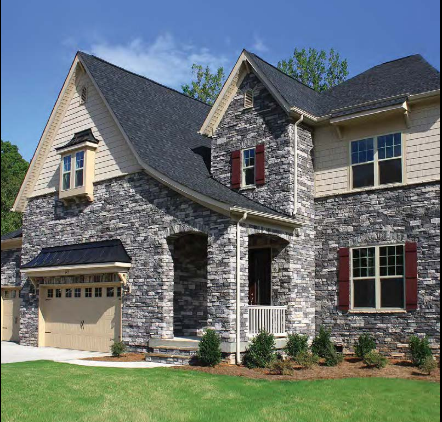
OLD WORLD LEDGE