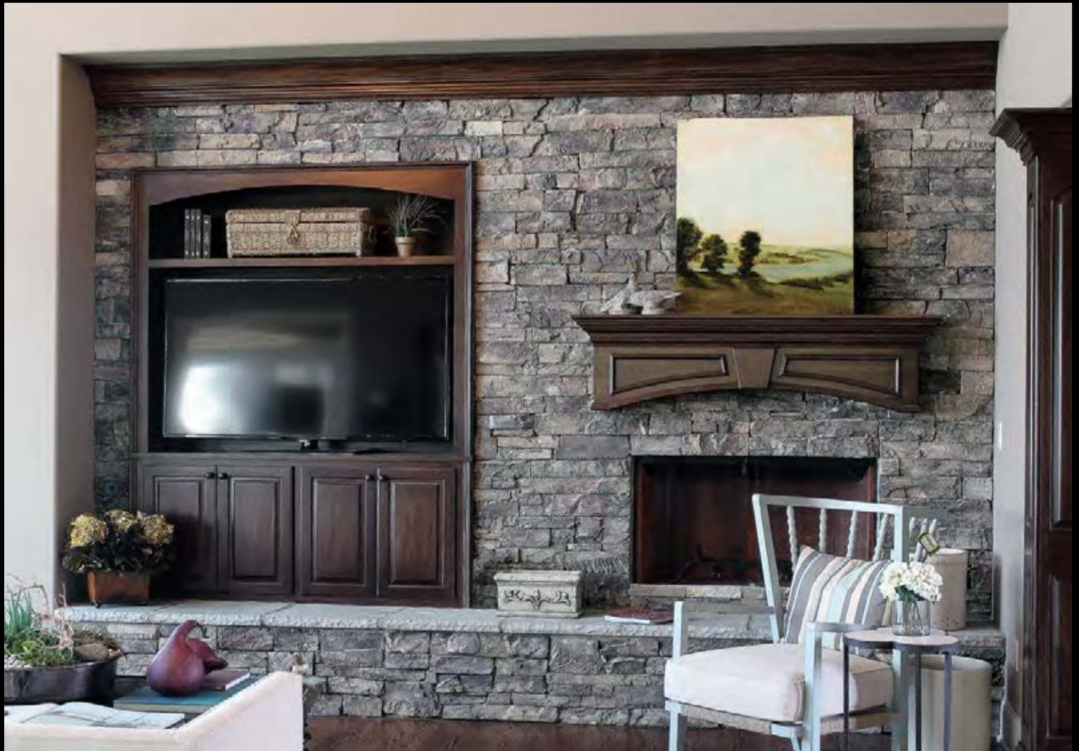
OLD WORLD LEDGE