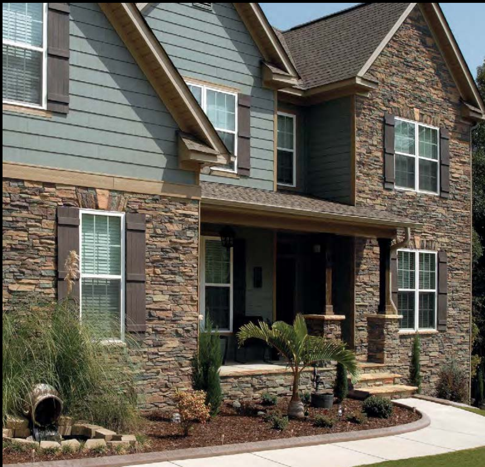
EASTERN MOUNTAIN LEDGE®