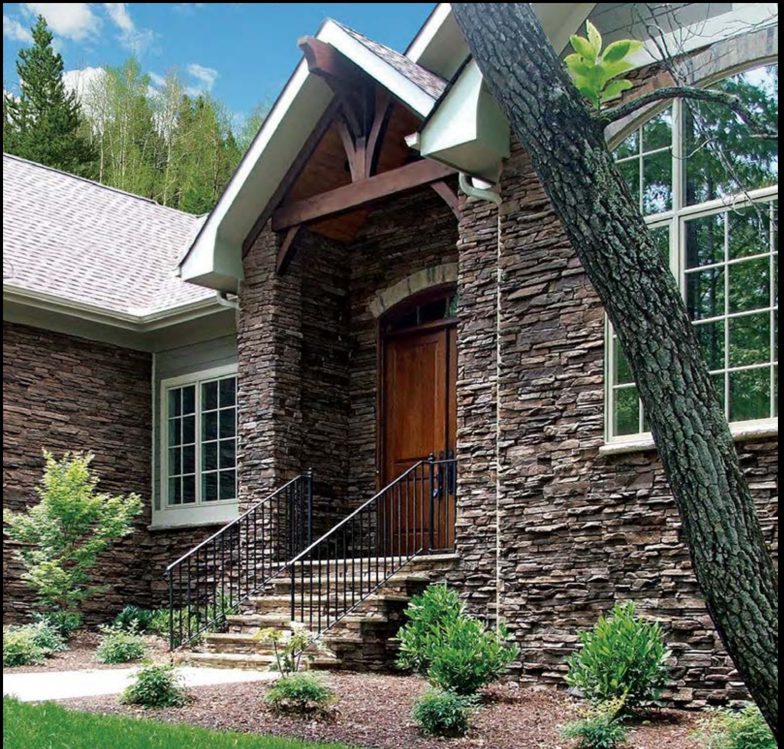
EASTERN MOUNTAIN LEDGE®