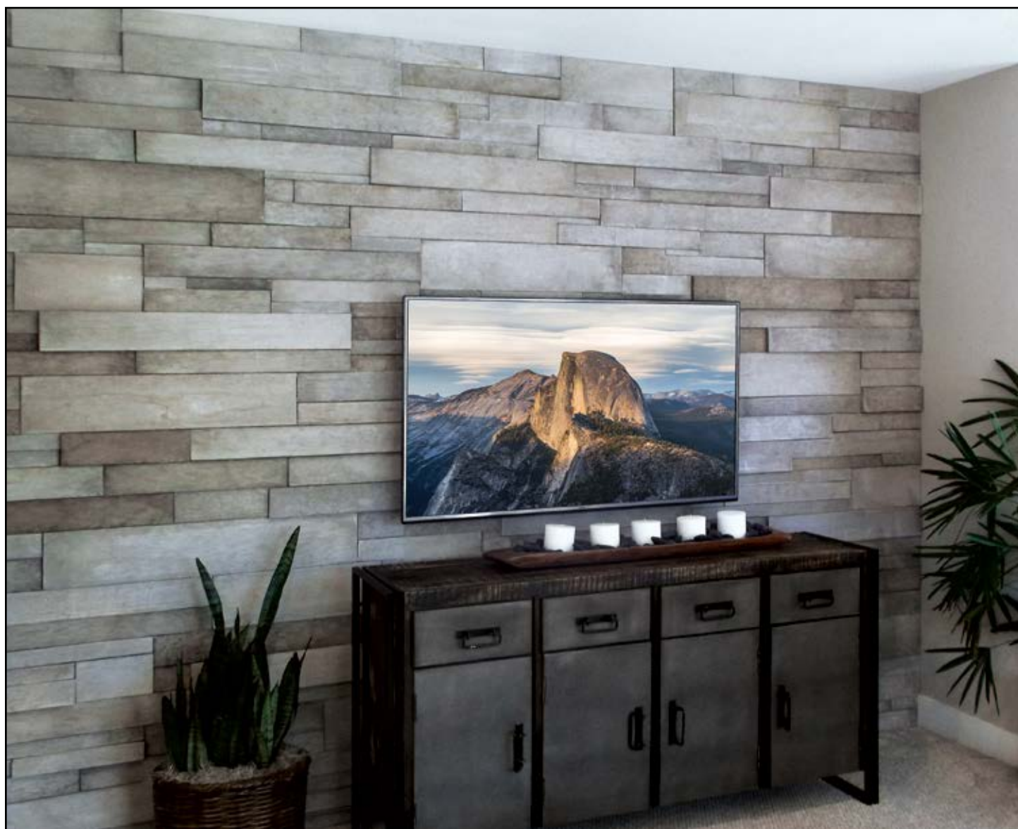
Industrial Ledge - Shale Grey

Apply the piece to the wall slightly above the desired position and work it in using a left-to-right motion until mortar squeezes from the perimeter and full-coverage adhesion is achieved. This process will also ensure enough excess mortar remains to fill any small gaps between stones and to help bond the individual pieces to each other. This will minimize the potential for moisture getting behind the stone. If too much mortar remains between the pieces, lift up the piece high enough to remove some of the excess mortar using a small tuck point trowel or similar tool and then reposition.