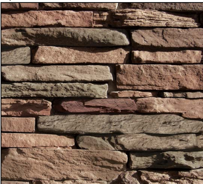
EASTERN MOUNTAIN LEDGE® COLOR: CHABLIS